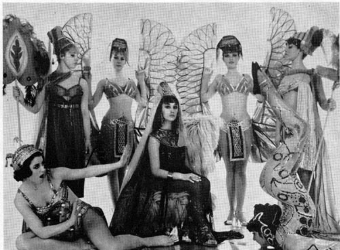
All Girl Revue "AS YOU LIKE IT"