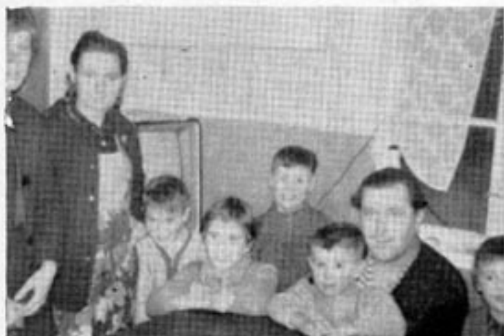
This is the needy German family that we are helping.