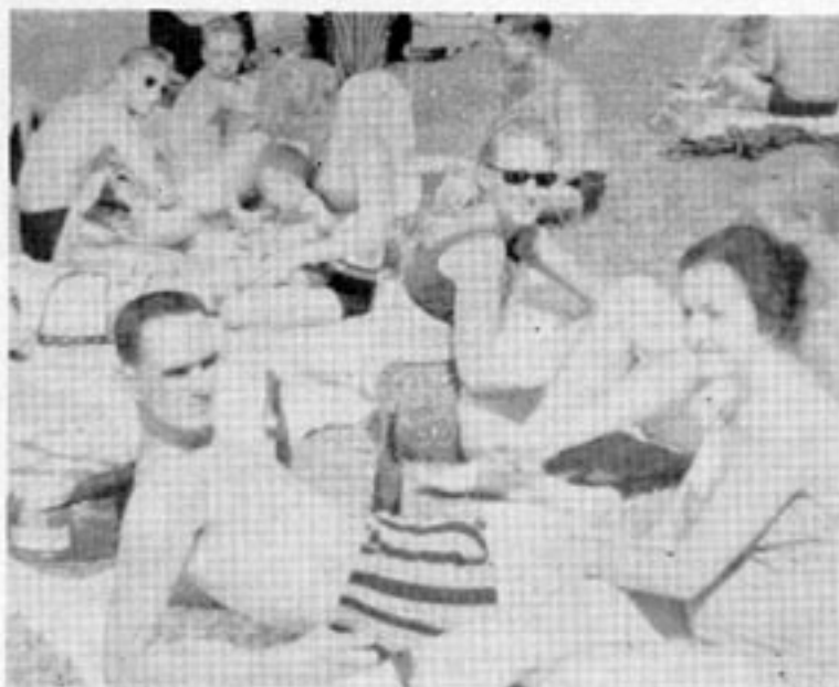
A great time was had at our swimming party on the 18th of July.

So now you see a little bit of what we do and what's been going on the past month in the Wives Club. Come on gals, we'd love to see you in the pictures of events to come, so why not join now? Our next business meeting will be August 6th in the Party Room of the Rocket Club at 1315 hours. The Rocket Club will pick up the tab for the Air Passenger Terminal nursery while you are at the meeting and your kiddies are safe in the nursery.